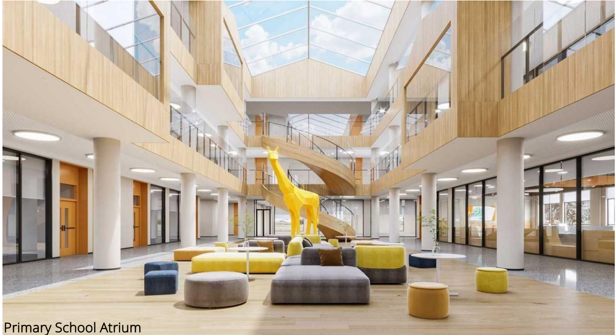
Primary School Atrium

The school will offer an international education for students aged 5 to 18 (Years 1 to 13) using the British curriculum and leading to the IGCSE and A level qualifications. These will allow our students to aspire to the very best universities worldwide.